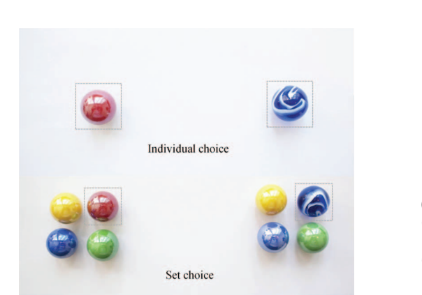
Figure 3. Choice options in the individual-choice condition (top) and set-choice condition (bottom) of Experiment 3. Choice options were physically shown to participants.

pared to the control condition, in which 11/74 (14.9%) chose the Rochefort beer, participants in the all-similar condition were more likely to choose the Rochefort (55/69; 79.7%), \chi^2(1, N = 143) = 60.41, p < .001 , and those in the all-different condition were less likely to (2/64; 2.9%), \chi^2(1, N = 138) = 5.54, p < .001 . Note that although there are alternative explanations for why Rochefort's choice share would increase in the all-similar condition (e.g., telling participants that they had already chosen three Rocheforts may have been seen as an implicit recommendation or as informative about their or their host's preferences) none of these explanations would explain why Rochefort's choice share would decrease (relative to control) in the all-different condition.