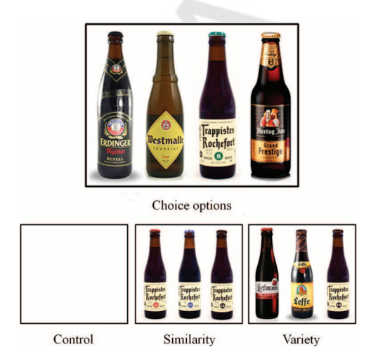
Figure 4. Choice options and endowed sets from Experiment 4. The top panel shows the choice options. The bottom panels show the beers participants in each condition were said to have already selected.

One challenge for any alternative to the set-fit account would be to explain why people prefer similarity under some circumstances but variety under others. As we showed in Experiment 4, fit (or lack thereof) with either an all-similar or all-different set can affect the attractiveness of a choice option. We ran an additional test of this idea, including all hypothesized effects within one experiment. We ran four conditions in which participants chose between two sets of mugs (see Figure 5). These sets were designed in such a way that in each condition the only difference between the two choices was a green vs. an orange mug. Adding three green mugs to both options ( all-similar green ) we found that the majority