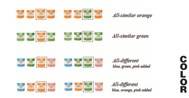
Figure 5. Participants chose between two sets of mugs (see supporting materials for details). Note that the only difference between the two choice options is always the green versus orange mug. Boxes are added to the pictures for clarification but were not part of the original stimuli.

(60.4%) chose the set with the fourth green mug. Adding three orange mugs to both options ( all-similar orange ) reversed preferences—now the majority (62.3%) chose the set of four orange mugs (p = .03). These two conditions reveal the all-similar effect. In the other two conditions we found the all-different effect. In the first condition we added a blue, pink, and orange mug to both options. In this case the majority (84.3%) chose the set with the green mug. When we added a blue, pink, and green mug to the two original options, the majority (94.1%) chose the set with the orange mug (p < .001).<sup>5</sup>