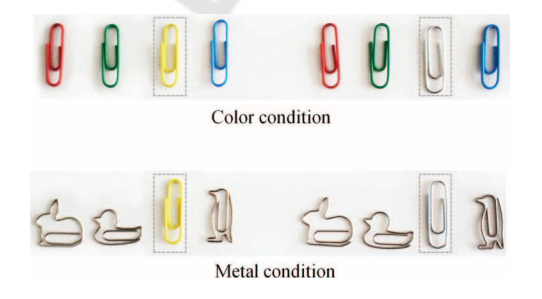
Figure 2. Choice sets in the color condition (top) and metal condition (bottom) of Experiment 2. These sets were physically shown to participants. Note that the yellow and metal clips appear once per set in each condition.

Participants (207 Fontys University Tilburg [Tilburg, the Netherlands] students; 154 female; M_{age} = 19.7 ) imagined buying specialty beer for a party. Participants were told that they had already chosen three beers and that they could choose one more from an assortment of four, which included a beer from Rochefort Abbey (see Figure 4). In the control condition, participants were given no further information and simply chose which beer they would purchase. In the remaining two conditions, participants saw the three beers they had (allegedly) already chosen: In the allsimilar condition, these were three beers from Rochefort Abbey; in the all-different condition, these were beers from three different brewers including Rochefort. We expected that compared to those in the control condition, participants in the all-similar condition would be more likely to choose the Rochefort beer (because it would fit best with the "all-similar" set), and those in the alldifferent condition would be less likely to choose this beer (because it would not fit with the "all -different" set). Indeed, com-